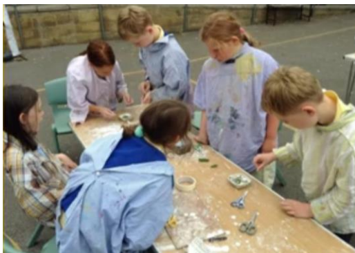
Creating their own art works