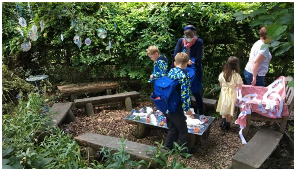
Art work on display for family members to enjoy

Do take a look at our website http://www.southrop.gloucs.sch.uk/ and Facebook https://www.facebook.com/Southrop-C-of-E-Primary-School-102756552016864/ to find out more, and to see slideshows of our recent activities.