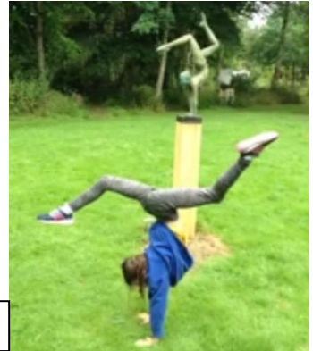
Copying the poses at the Cotswold Sculpture Park

Instead of our customary residential, all of the Swans experienced a dawn-to-dusk day at Hill End Activity Centre. We were lucky enough to spend time in Wytham Woods, an ancient semi-natural woodland, designated Site of Special Scientific Interest and one of the most researched pieces of woodland in the world, exceptionally rich in flora and fauna. On our survival course we learnt how to: build dens; light fires with a steel; trap bears (!); tell which plants were toxic and which edible; purify water with cotton wool, grass and charcoal. Later we undertook team building challenges, for example to guide a blind-folded partner through tyres, under scramble nets and around the trees. As everyone else left the centre for the day we enjoyed some free-time and then finally barbecued our evening meal round the campfire, toasted marshmallows and enjoyed a cup of hot chocolate - the perfect end to a perfect day!