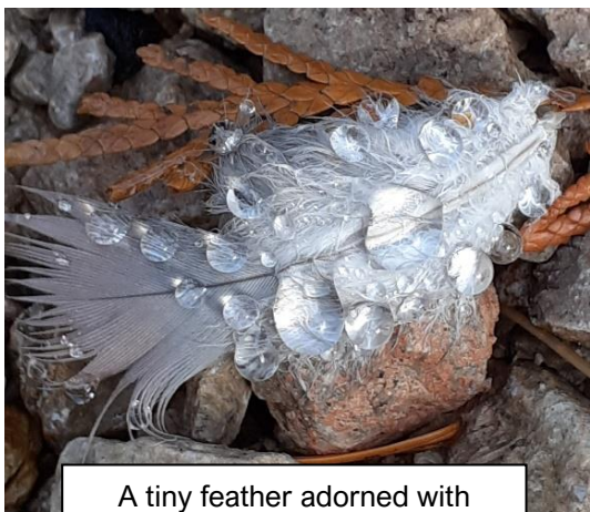
A tiny feather adorned with droplets, found on a forest floor

Or perhaps, like Thomas Hardy, we can stand and listen out for the hopeful and joyous sound of birdsong in the trees.