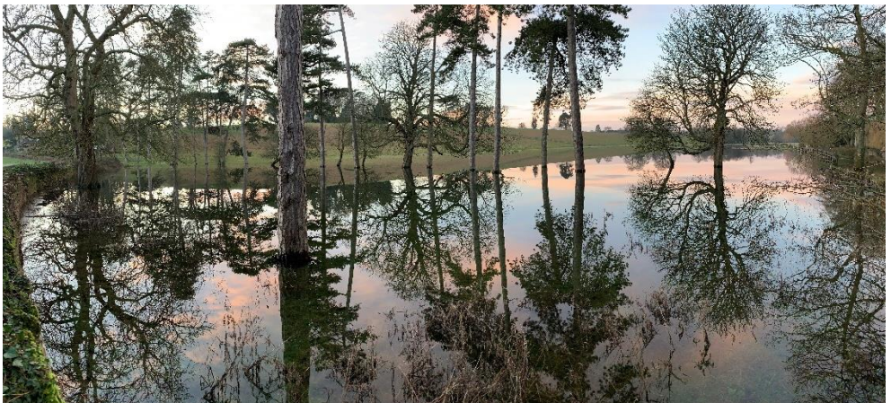
Reflections of trees in the flood water of the River Coln, near Netherton, Quenington

Alternatively, Southrop Parish Council still has some trees to plant locally - get in touch with them if you would like to help. They will be able to let you know when COVID-safe planting is being organised.